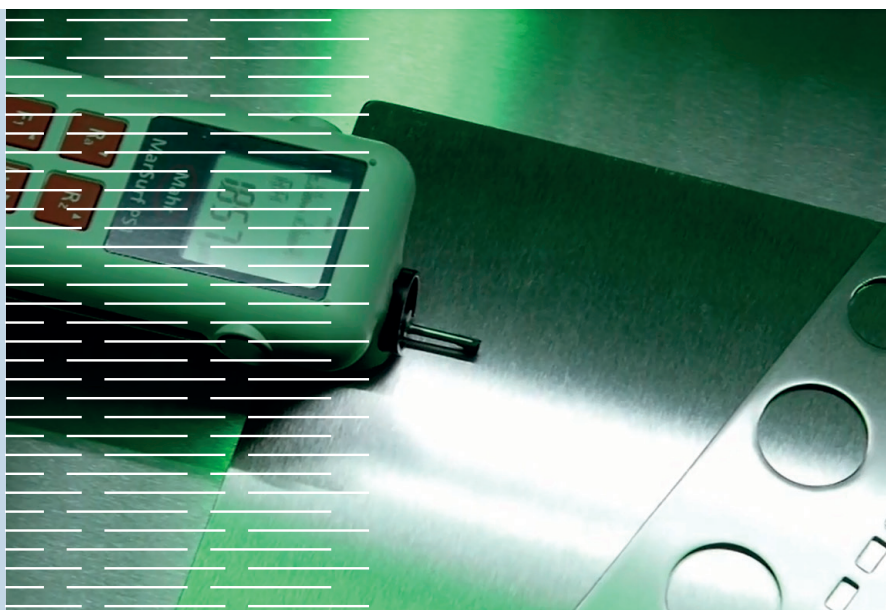
HERMES MERCURIT® BW 590